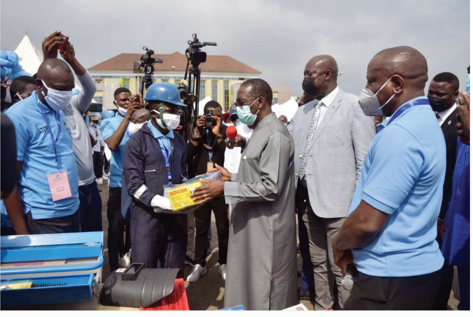
Gov. Okowa presenting starter pack item to a STEP beneficiary in welding and fabrication