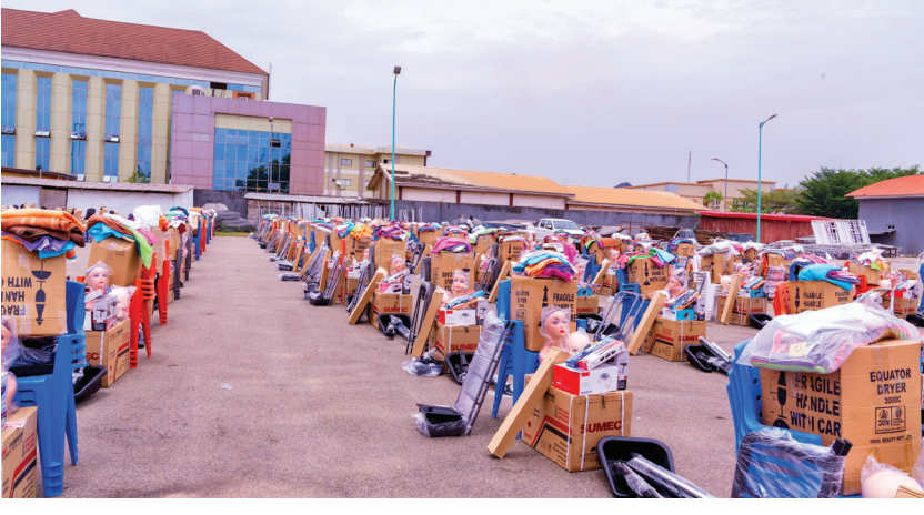
Starter Packs for GEST trainees