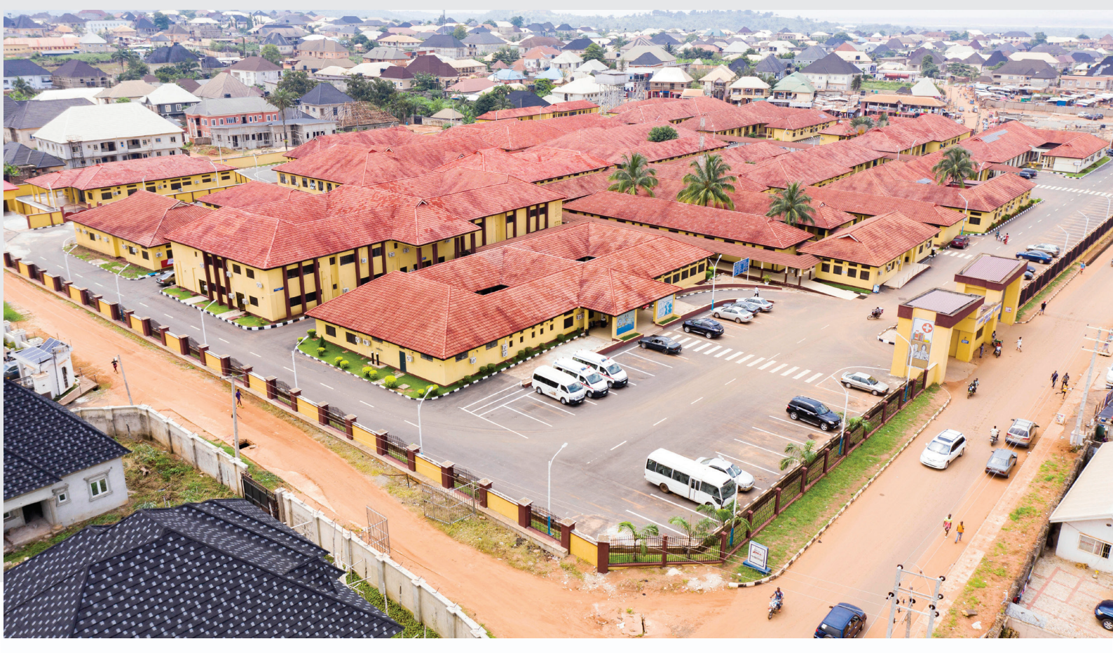
Asaba Specialist Hospital