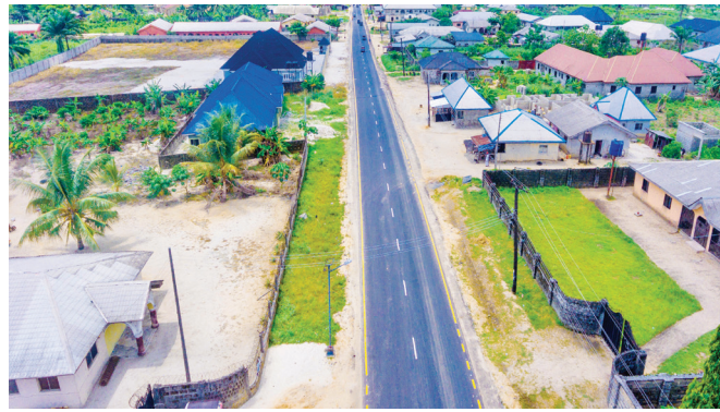
Agbarho/Orherhe Road, Ughelli North LGA