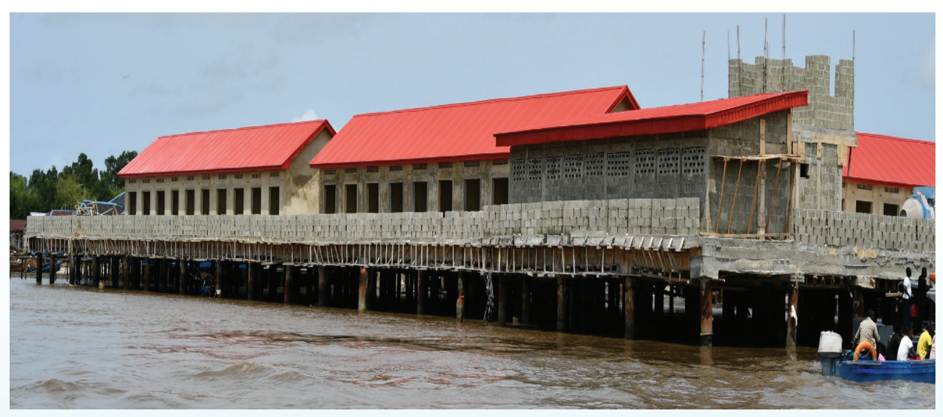
Ogheye Floating Market