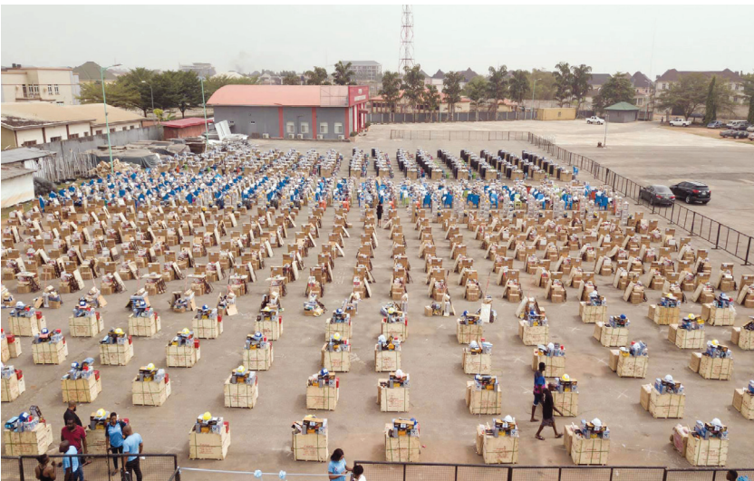
Starter Packs for RYSA trainees

WESAP, WIDOWS EMPOWERMENT & DESOPADEC skill acquisition and empowerment programme.